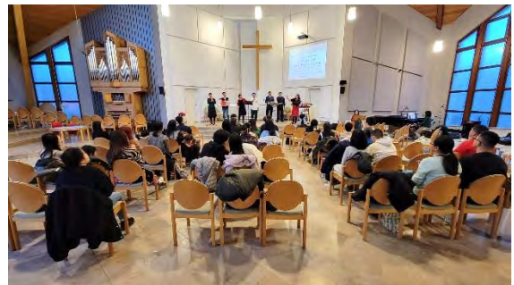
12 月聖誕福音特會，70 人出席。