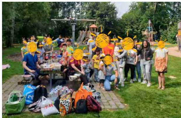
Family Fellowship in Göttingen