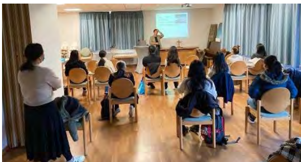
October New Students Outreach Workshop – Laws in Germany (hybrid arrangement of in-person/online delivery)

Although the "coexistence with the pandemic" has become an unchanging fact, it posed immense challenges to the missionary field. Since this summer, Göttingen and Kassel have fully resumed in-person gatherings at church. However, we still offer simultaneous online and in person gatherings for worship and Bible study group.