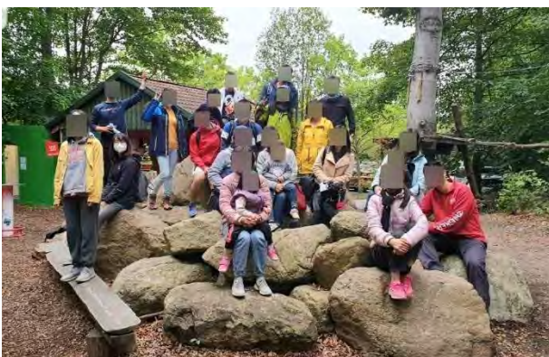
2020/09 Lockdown measures lessened, an opportunity to get out of our apartments -- Outreach: Rope Tree Climbing & Hiking

① Joint Online Worship/Sunday School with Four Cities: If restriction of in-person worship is still in effect, we will continue to partner with two other CBM missionary units to host joint worship online. This has allowed us to better coordinate the limited resources in the mission field. The Bible Study & Prayer Meetings for Göttingen and Kassel continued to gather online during weeknights.