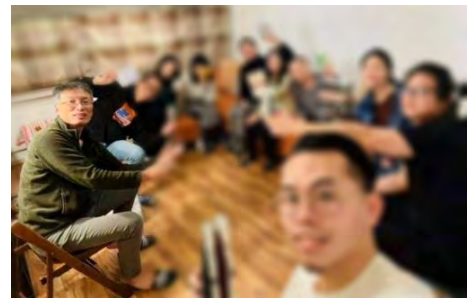
Students returning to an in-person gathering at our home

believers. We will break ground and launch the student outreach in Göttingen with different monthly outreach activities, starting this year. We hope to reach out to friends who are interested in learning more about our faith, to promote relational evangelism. In Kassel, we will strengthen those involved in the ministry by equipping them with training and more opportunities to serve. We will continue to encourage brothers and sisters to step up on the ministry journey.