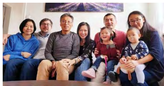
The 3 missionaries unit of CBM in Germany