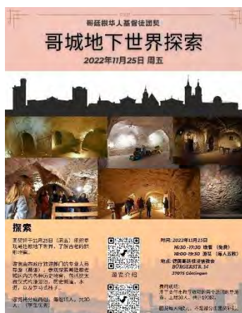
Poster Promotion: Exploring Göttingen Underground