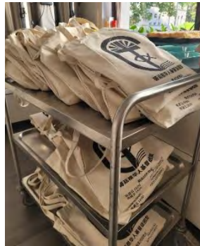
Gift Bags for Newcomers

shown through relational ministry and the Christmas Celebration have sown seeds into the hearts of seekers. Just as I have promised you, “We will use you to the fullest!” May God reward your hard work and loyalty!