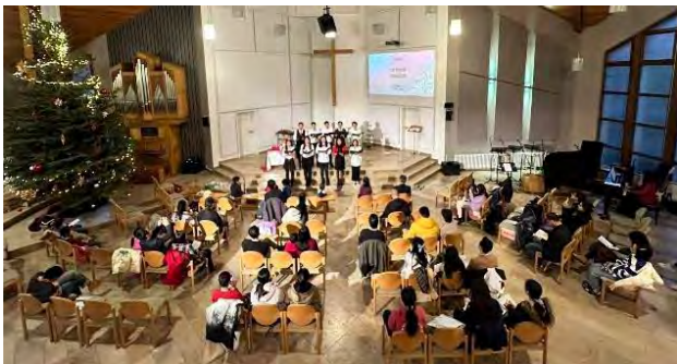
December 25 th – Christmas Gospel Celebration

Praise the Lord, the past 3 years of the pandemic were tiring. Evangelism during the post-pandemic era has been even more arduous. We upheld church ministries for one year, & the Spirit began to work in His people & led them to repentance. When people returned to God, naturally, the desire for holy work was awoken. Programs were no longer just the execution of activities. They were delivered sincerely in response to Jesus’ love & His love for the souls of mankind. We experienced the true meaning, “...to uproot and tear down, to destroy and overthrow, to build and to plant.” (Jeremiah 1:10) We gave thanks to the Father for the small revival our church had experienced, a change in both quality & quantity. May the Spirit watch over Göttingen so we will remain in steps, & be alert & persistent in prayers for the sake of the Gospel. Glory be to God in the Highest!