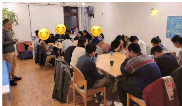
November – Alpha course

② Multiple Connection Points: The main purpose of the follow-up is to maintain a close connection with the newcomers. The various activities allow them to experience how Christianity is applied in different aspects of life. It is another approach to introduce “Holistic Gospel”: (a) Networking Over Food & Fun: “Getting to Know the Old City of Göttingen + Love Feast” (30+ attendees), “Exploring Göttingen Underground + Love Feast” (30 attendees); (b) Emotional Well-being: The series of “Personal Growth” in Sunday School includes topics on emotions, stress management, & self-esteem (20 + attendees); (c) Exploring Christian Faith: Friday weekly session of the Alpha Course for the young adult group (average 16 -26 attendees, 2/3 are seekers).