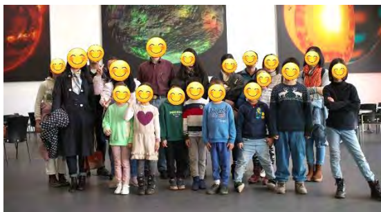
上：兒童/青少年外展活動 - 馬普所太陽系所參觀 下：職青組外展活動