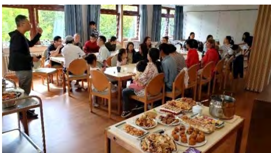
September – Mid-autumn Festival Outreach Program

The high mobility of believers in university cities is not a new challenge. You may wonder: how difficult is it? Since the pandemic, there were more than 20 believers & families who left Göttingen following graduation or for a job search. Only two student believers remained in town. We had to start the "Young Adult Ministry" from scratch again. It was the most difficult time because resources had been very limited in the past two summers; only 4-5 people committed to serving the church. We had to continuously encourage brothers & sisters who became frustrated with the situation. We persisted to keep the church open, & looked beyond the attendance number for validation of success. We maintained the in-person gatherings (while simultaneously providing online platforms). The core group had to stand firm & wait for God's timing. Sure enough, after more than a year, the Holy Spirit graced the church like the spring breeze. The lives of the congregations were renewed one by one. The spiritual revival was most apparent from September to December. God added newcomers & new believers to the church; this small revival refreshed brothers & sisters' souls & enabled them to experience God's work!