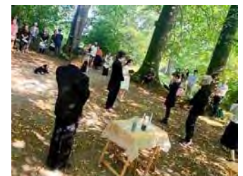
Officiating an Outdoor Wedding of a Couple with German and Chinese heritage