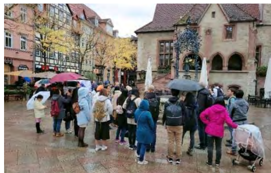
October – Getting to Know the Old City of Göttingen

Young Adult Group (Age: 22-35): In September, we hosted an outreach workshop, "Open Your Eyes before Marriage". In addition to biblical principles & case studies, we addressed directly people's need for affirmation by falling in love & the choice of sexual intimacy. We also responded to Christians' teachings on sexual chastity & the struggles with sexual temptation. Both believers & non-believers were exceptionally studious & attentive as they listened, discussed & took notes throughout the session. The workshop subverted their traditional thinking that there are only "outdated moral theories in Christianity". We had a very down-to-earth dialogue with this generation! Afterwards, the believers took the initiative to share their experiences in their past & present relationships, lust temptation, etc. Praise the Lord, they were willing to open their hearts & confessed their hidden sins to God. They fasted, repented, & resolved to live a holy life. They established a network to authorize pastors & spiritual friends to uphold each other in accountability. "Those