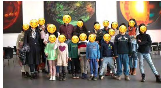
Children/Youth Outreach - MPI Solar System Visit