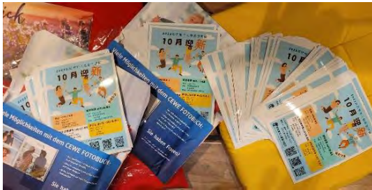
October New Students Orientation Program: Outreach flyers for handing out in the marketplace & at the campuses.