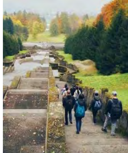
October New Students Outreach Program – One Day Trip to Kassel Wilhelmshöhe Highland