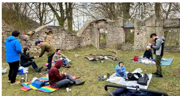
A day of outdoor fun in Göttingen: hiking, leek picking, picnic and Gospel leaflet distribution training.

In Germany, there were fewer than 1,000 pandemic new cases every day since the end of June. Different states began to lift the restrictions in varying degrees. Approximately 55% of the population received the first shot of the vaccine, and about 33% of the population received both shots. The supply of vaccines in Germany has been quite tight. Fortunately, we were placed on the vaccination waiting list with our family doctor, and we actually received our shots earlier. Praise the Lord, our family will receive the second vaccine in early July and will return to Canada by the end of the month. Just in time, the Canadian government amended the entry and pandemic prevention policy; our mandatory hotel quarantine for the first three days can be exempted. During the summer vacation in Toronto, we will spend half of our time continuing to serve the congregations in Germany online, and half the time, we will be on vacation and will prepare Caleb for his university freshman year in Canada.