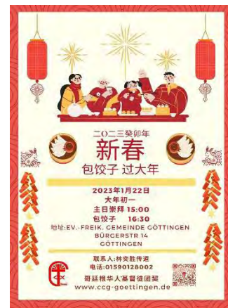
Poster Promotion: Dumplings Feast for Chinese New Year