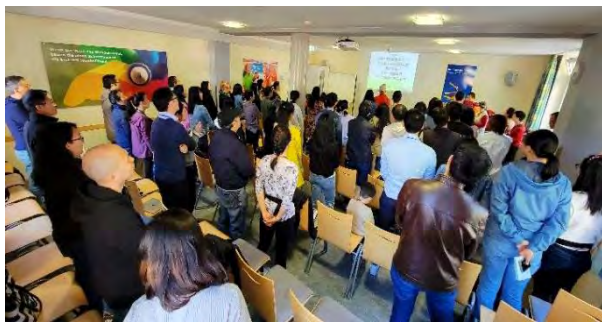
Retreat – Adult Program

year’s venue. The neighboring youth hostels are either fully booked or closed for renovations. May the Lord prepare us with a suitable location.