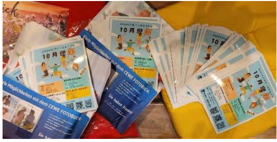
10月份的迎新活動·(上) 弟兄姊妹在市中心和校園派發單張； (下) 給新生的禮物袋。