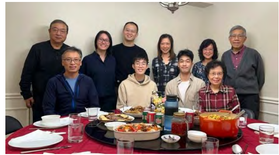
Reunion with the Short-Term Mission Team from Toronto Chinese Baptist Church during our home assignment.

We were able to share our experience and missionary vision with many different churches during our home assignment. We also had time to discuss how to collaborate resources in planning for next year’s programs, and to spend time with brothers and sisters from previous short-term mission teams.