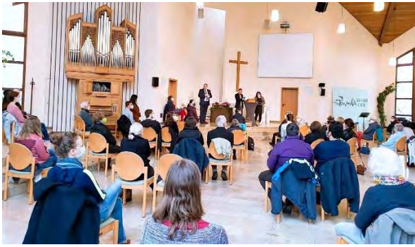
Göttingen Joint Worship – the Chinese & the German Baptist Church

In this quarter newsletter, we invited two church members to share their blessings during the pandemic year in first person narrative.