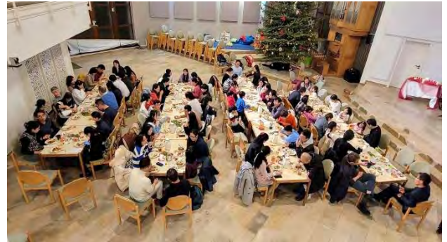
December 25 th – Christmas Celebration Dinner