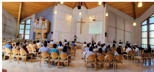
June: Baptism worship gathering in Göttingen, 60+

In my last year of university, while my classmates were busy planning for their future careers, I locked myself in a single apartment for weeks and months. I was limited to ordering food delivery. After the meal, I would remain in bed. When my condition was more severe, I was unable to even hold the phone or breathe. Then I decided it was time to put an end to everything.