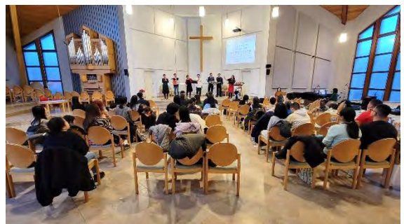
70 people in attendance at the Christmas Gospel Celebration in December.