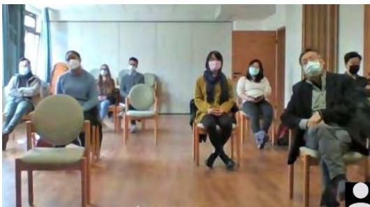
In-person children & youth Sunday schools had been suspended and most families could only gather online. The Göttingen Fellowship resumed in-person worship again in March with 14 adults & 2 children.

Regardless of whether there were in-person gatherings, we must provide a synchronized online platform. In the mission field, we were faced with the limitations of rental venues, insufficient technical equipment, lack of IT personnel and many other complicated procedures. Why didn't we just focus on organizing online gatherings? Reasons: ① In Germany, the only in-person activity that allowed gathering of more than 10 people while maintaining physical distancing is worship. ② Most of the students and professional lived alone. Their living space was approximately 100 square feet. Some dormitory buildings were hardly occupied (because schools only offered online classes and the students had moved out). This kind of loneliness could be very deflating. ③ Yes, there was no shortage of various online Bible courses offered overseas during the pandemic. However, people are naturally inert and can lose track easily. The inactive believers would become more and more marginalized. Therefore, we must seize all opportunities for physical gathering to practice worshipping in one spirit and unity.