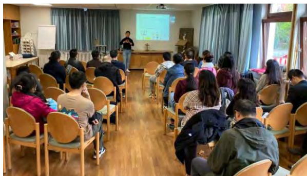
October – Basic Legal Knowledge in Germany Workshop

who cleanse themselves from the latter will be instruments for special purposes, made holy, useful to the Master & prepared to do any good work." (2 Timothy 2:21, NIV)