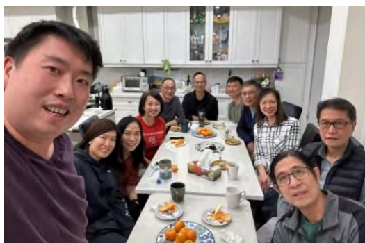
During home assignment, we had dinner with MCBC missionary care team.