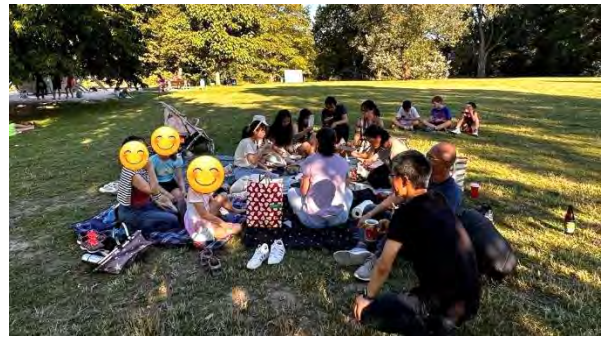
Outreach activities of the Career & Students Group