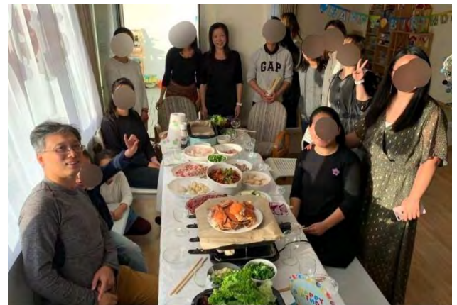
2020/08 Lockdown measures lessened, took the opportunity to gather & feast – precious moment.

④ Online Learning: The believers identified many emotional & relationship issues during the pandemic, in response, we led online courses to address their needs: “Sexuality from the Biblical Perspective”, “Family of Origin” & “Prepare & Enrich”. The upcoming online programs in 2021 include: “Inductive Bible Study”, “Caring Training course”, “Adult Sunday School Train-the-Teacher” (including one-on-one mentoring, lesson plan & pre-study, in-class demonstration & supervision). We will observe the needs of the congregation and consider the course on “Personal Growth”, in the later half of the year.