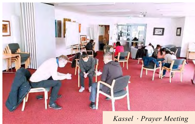
Kassel · Prayer Meeting

Gospel leaflets regularly and contacted the university in hope that an evangelist book fair could be set up again. Brothers and sisters in Kassel took the one-on-one approach to follow up with those who have shown interest in the faith. A couple in Christ creatively thought of bringing food and Gospel videos to seekers’ home, and then studied the Alpha-courses together after meal. After several weeks of “Gospel potluck”, we won over two friends for the Lord! Praise the Lord, for the power of the Gospel is not restricted by environment.