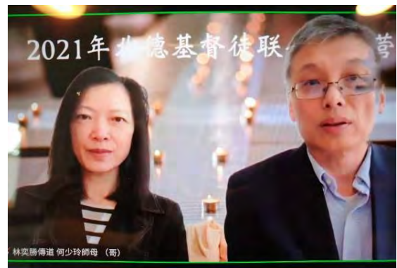
Online Workshop during North Germany Joint Retreat in May

The restaurant industry was hit the first and hard in the pandemic. I became unemployed. My husband was laid off for a few months. However, unemployment allowed me more time to read the Bible. I have been practising morning prayers and devotion for 10 months, learning to let God be the Head of the family. I am thankful that the Lord taught us to treasure our family time and make peace in our home. This year was also the first year when our family could celebrate Christmas and Chinese New Year together! My three daughters were able to join the weekly worship online, their spiritual lives were nourished. I’m not sure when we would be able to transform fully into a “Christian Family”, but I’m sure that God’s grace never left us. We have all grown a lot in this pandemic. Looking back at the past year, I only have thanksgivings, as all the days were filled with grace from above!