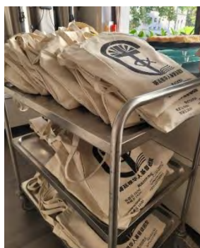
Gift Bags for Newcomers

shown through relational ministry and the Christmas Celebration have sown seeds into the hearts of seekers. Just as I have promised you, “We will use you to the fullest!” May God reward your hard work and loyalty!