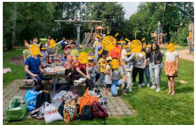
Family Fellowship in Göttingen