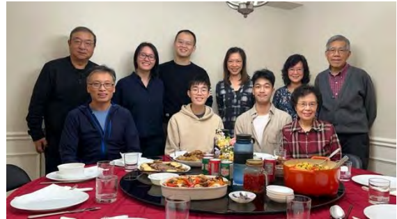
Reunion with the Short-Term Mission Team from Toronto Chinese Baptist Church during our home assignment.

We were able to share our experience and missionary vision with many different churches during our home assignment. We also had time to discuss how to collaborate resources in planning for next year's programs, and to spend time with brothers and sisters from previous short-term mission teams.