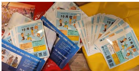
October New Students Orientation Program: Outreach flyers for handing out in the marketplace & at the campuses.