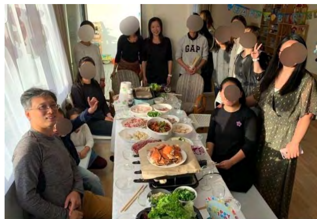
2020/08 Lockdown measures lessened, took the opportunity to gather & feast – precious moment.

④ Online Learning: The believers identified many emotional & relationship issues during the pandemic, in response, we led online courses to address their needs: “Sexuality from the Biblical Perspective”, “Family of Origin” & “Prepare & Enrich”. The upcoming online programs in 2021 include: “Inductive Bible Study”, “Caring Training course”, “Adult Sunday School Train-the-Teacher” (including one-on-one mentoring, lesson plan & pre-study, in-class demonstration & supervision). We will observe the needs of the congregation and consider the course on “Personal Growth”, in the later half of the year.