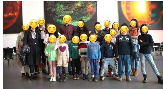
Children/Youth Outreach - MPI Solar System Visit