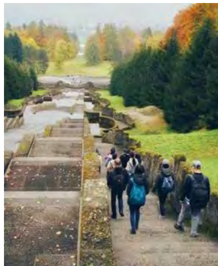
October New Students Outreach Program – One Day Trip to Kassel Wilhelmshöhe Highland