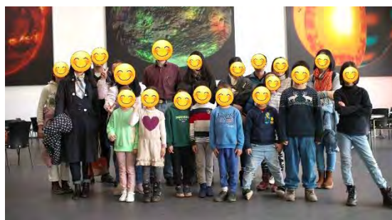
上：兒童/青少年外展活動 - 馬普所太陽系所參觀