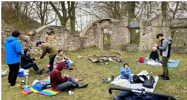
A day of outdoor fun in Göttingen: hiking, leek picking, picnic and Gospel leaflet distribution training.

In Germany, there were fewer than 1,000 pandemic new cases every day since the end of June. Different states began to lift the restrictions in varying degrees. Approximately 55% of the population received the first shot of the vaccine, and about 33% of the population received both shots. The supply of vaccines in Germany has been quite tight. Fortunately, we were placed on the vaccination waiting list with our family doctor, and we actually received our shots earlier. Praise the Lord, our family will receive the second vaccine in early July and will return to Canada by the end of the month. Just in time, the Canadian government amended the entry and pandemic prevention policy; our mandatory hotel quarantine for the first three days can be exempted. During the summer vacation in Toronto, we will spend half of our time continuing to serve the congregations in Germany online, and half the time, we will be on vacation and will prepare Caleb for his university freshman year in Canada.