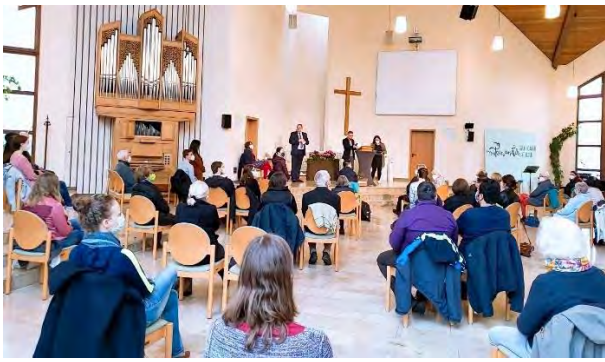
Göttingen Joint Worship – the Chinese & the German Baptist Church

In this quarter newsletter, we invited two church members to share their blessings during the pandemic year in first person narrative.