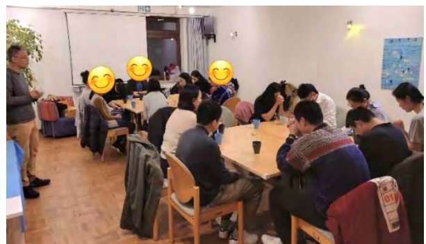
November – Alpha course

② Multiple Connection Points: The main purpose of the follow-up is to maintain a close connection with the newcomers. The various activities allow them to experience how Christianity is applied in different aspects of life. It is another approach to introduce “Holistic Gospel”: (a) Networking Over Food & Fun: “Getting to Know the Old City of Göttingen + Love Feast” (30+ attendees), “Exploring Göttingen Underground + Love Feast” (30 attendees); (b) Emotional Well-being: The series of “Personal Growth” in Sunday School includes topics on emotions, stress management, & self-esteem (20 + attendees); (c) Exploring Christian Faith: Friday weekly session of the Alpha Course for the young adult group (average 16 -26 attendees, 2/3 are seekers).