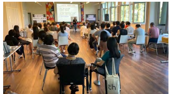
Aug 8–11: Germany-wide Chinese Co-workers Training Camp, Felain conducted a seminar.