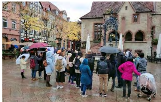
October – Getting to Know the Old City of Göttingen

Young Adult Group (Age: 22-35): In September, we hosted an outreach workshop, "Open Your Eyes before Marriage". In addition to biblical principles & case studies, we addressed directly people's need for affirmation by falling in love & the choice of sexual intimacy. We also responded to Christians' teachings on sexual chastity & the struggles with sexual temptation. Both believers & non-believers were exceptionally studious & attentive as they listened, discussed & took notes throughout the session. The workshop subverted their traditional thinking that there are only "outdated moral theories in Christianity". We had a very down-to-earth dialogue with this generation! Afterwards, the believers took the initiative to share their experiences in their past & present relationships, lust temptation, etc. Praise the Lord, they were willing to open their hearts & confessed their hidden sins to God. They fasted, repented, & resolved to live a holy life. They established a network to authorize pastors & spiritual friends to uphold each other in accountability. "Those