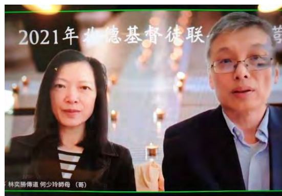
Online Workshop during North Germany Joint Retreat in May

The restaurant industry was hit the first and hard in the pandemic. I became unemployed. My husband was laid off for a few months. However, unemployment allowed me more time to read the Bible. I have been practising morning prayers and devotion for 10 months, learning to let God be the Head of the family. I am thankful that the Lord taught us to treasure our family time and make peace in our home. This year was also the first year when our family could celebrate Christmas and Chinese New Year together! My three daughters were able to join the weekly worship online, their spiritual lives were nourished. I'm not sure when we would be able to transform fully into a "Christian Family", but I'm sure that God's grace never left us. We have all grown a lot in this pandemic. Looking back at the past year, I only have thanksgivings, as all the days were filled with grace from above!