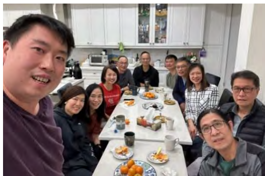
During home assignment, we had dinner with MCBC missionary care team.