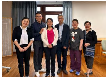
Top: Markham Chinese Community Church STM Team (6/5–18)