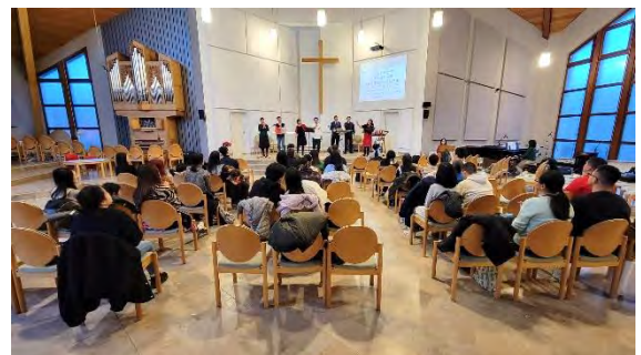
70 people in attendance at the Christmas Gospel Celebration in December.