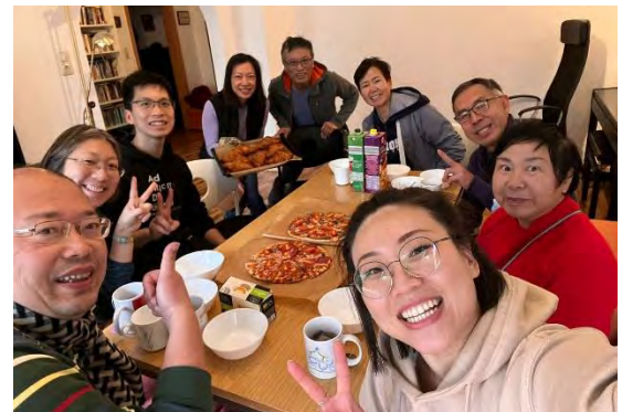
Bottom: Mississauga Chinese Baptist Church STM team (12/4–17)