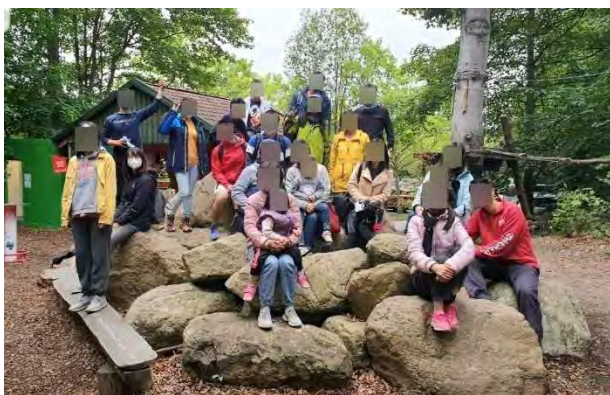
2020/09 Lockdown measures lessened, an opportunity to get out of our apartments -- Outreach: Rope Tree Climbing & Hiking

① Joint Online Worship/Sunday School with Four Cities: If restriction of in-person worship is still in effect, we will continue to partner with two other CBM missionary units to host joint worship online. This has allowed us to better coordinate the limited resources in the mission field. The Bible Study & Prayer Meetings for Göttingen and Kassel continued to gather online during weeknights.