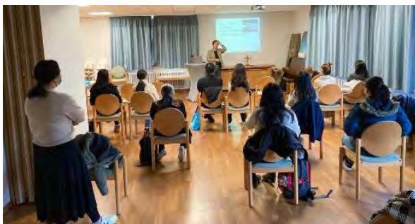
October New Students Outreach Workshop – Laws in Germany (hybrid arrangement of in-person/online delivery)

Although the "coexistence with the pandemic" has become an unchanging fact, it posed immense challenges to the missionary field. Since this summer, Göttingen and Kassel have fully resumed in-person gatherings at church. However, we still offer simultaneous online and in person gatherings for worship and Bible study group.