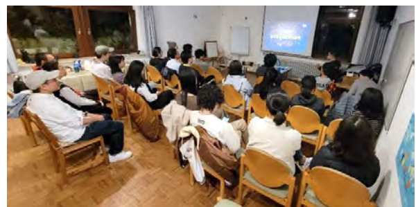
November: Alpha Course