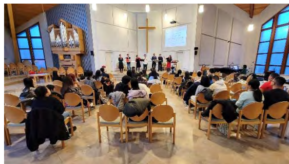
12 月聖誕福音特會，70 人出席。