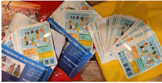
10 月份的迎新活動，(上) 弟兄姊妹在市中心和校園派發單張； (下) 給新生的禮物袋。