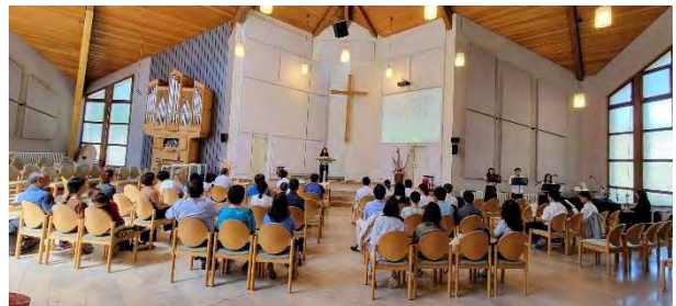
June: Baptism worship gathering in Göttingen, 60+

In my last year of university, while my classmates were busy planning for their future careers, I locked myself in a single apartment for weeks and months. I was limited to ordering food delivery. After the meal, I would remain in bed. When my condition was more severe, I was unable to even hold the phone or breathe. Then I decided it was time to put an end to everything.