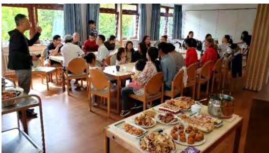
September – Mid-autumn Festival Outreach Program

The high mobility of believers in university cities is not a new challenge. You may wonder: how difficult is it? Since the pandemic, there were more than 20 believers & families who left Göttingen following graduation or for a job search. Only two student believers remained in town. We had to start the "Young Adult Ministry" from scratch again. It was the most difficult time because resources had been very limited in the past two summers; only 4-5 people committed to serving the church. We had to continuously encourage brothers & sisters who became frustrated with the situation. We persisted to keep the church open, & looked beyond the attendance number for validation of success. We maintained the in-person gatherings (while simultaneously providing online platforms). The core group had to stand firm & wait for God's timing. Sure enough, after more than a year, the Holy Spirit graced the church like the spring breeze. The lives of the congregations were renewed one by one. The spiritual revival was most apparent from September to December. God added newcomers & new believers to the church; this small revival refreshed brothers & sisters' souls & enabled them to experience God's work!