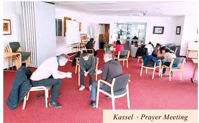
Kassel · Prayer Meeting

Gospel leaflets regularly and contacted the university in hope that an evangelist book fair could be set up again. Brothers and sisters in Kassel took the one-on-one approach to follow up with those who have shown interest in the faith. A couple in Christ creatively thought of bringing food and Gospel videos to seekers' home, and then studied the Alpha-courses together after meal. After several weeks of "Gospel potluck", we won over two friends for the Lord! Praise the Lord, for the power of the Gospel is not restricted by environment.